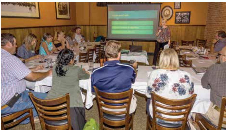
School board candidate briefing at the Loveland Chophouse

Generally, school district board member elections receive very little attention unless there is enough controversy in a particular school district to stir up voters other than school district employees. This year was an exception.