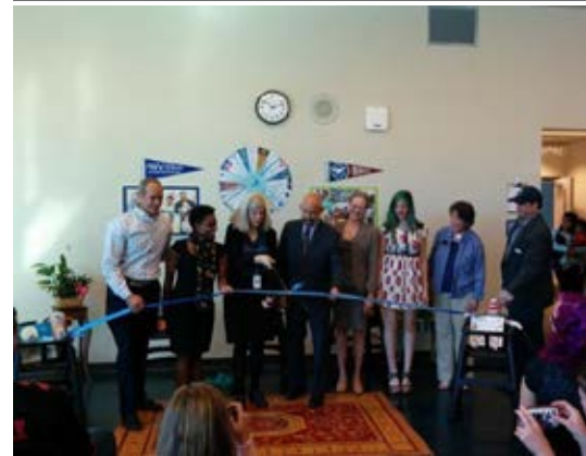
Ribbon Cutting ceremony at New Legacy