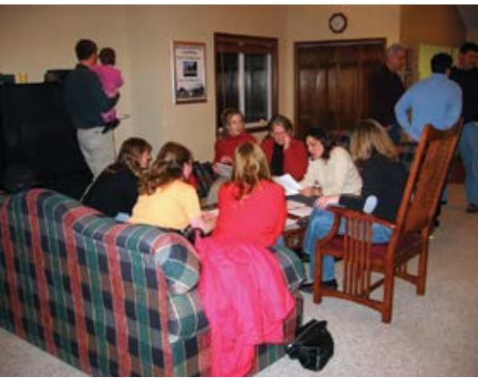
The American Academy team works on plans for the school