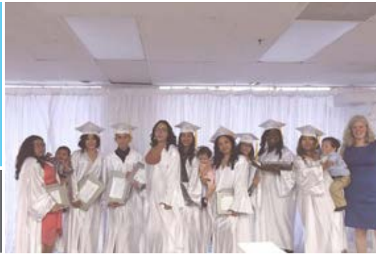
Teen parents celebrate graduation with their children