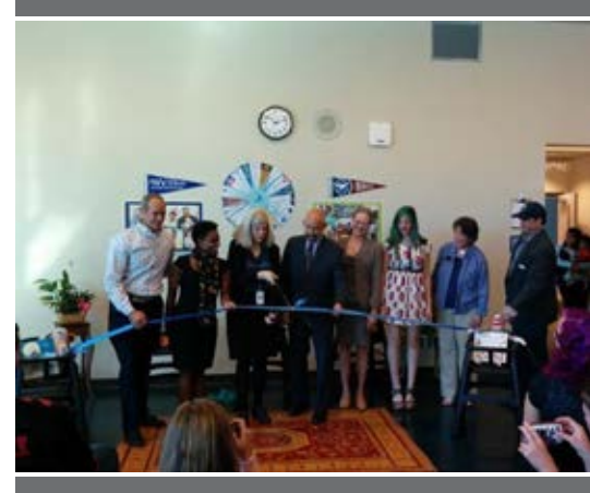
Ribbon Cutting ceremony at New Legacy

and districts with more than 3,000 pupils are also granted such authority by the state board if they can demonstrate a "recent pattern of providing fair and equitable treatment to its charter schools."<sup>27</sup> Only five Colorado school districts with more than 3,000 students do not currently have exclusive chartering authority.<sup>28</sup>