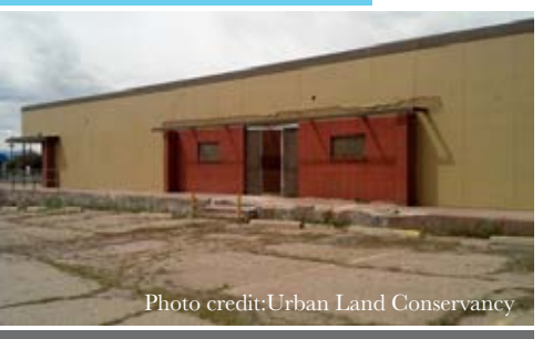
The abandoned bowling alley that would eventually become New Legacy

Though New Legacy differs greatly in almost every respect from American Academy, the two schools' largest financial hurdle was the same: Acquiring an adequate facility.