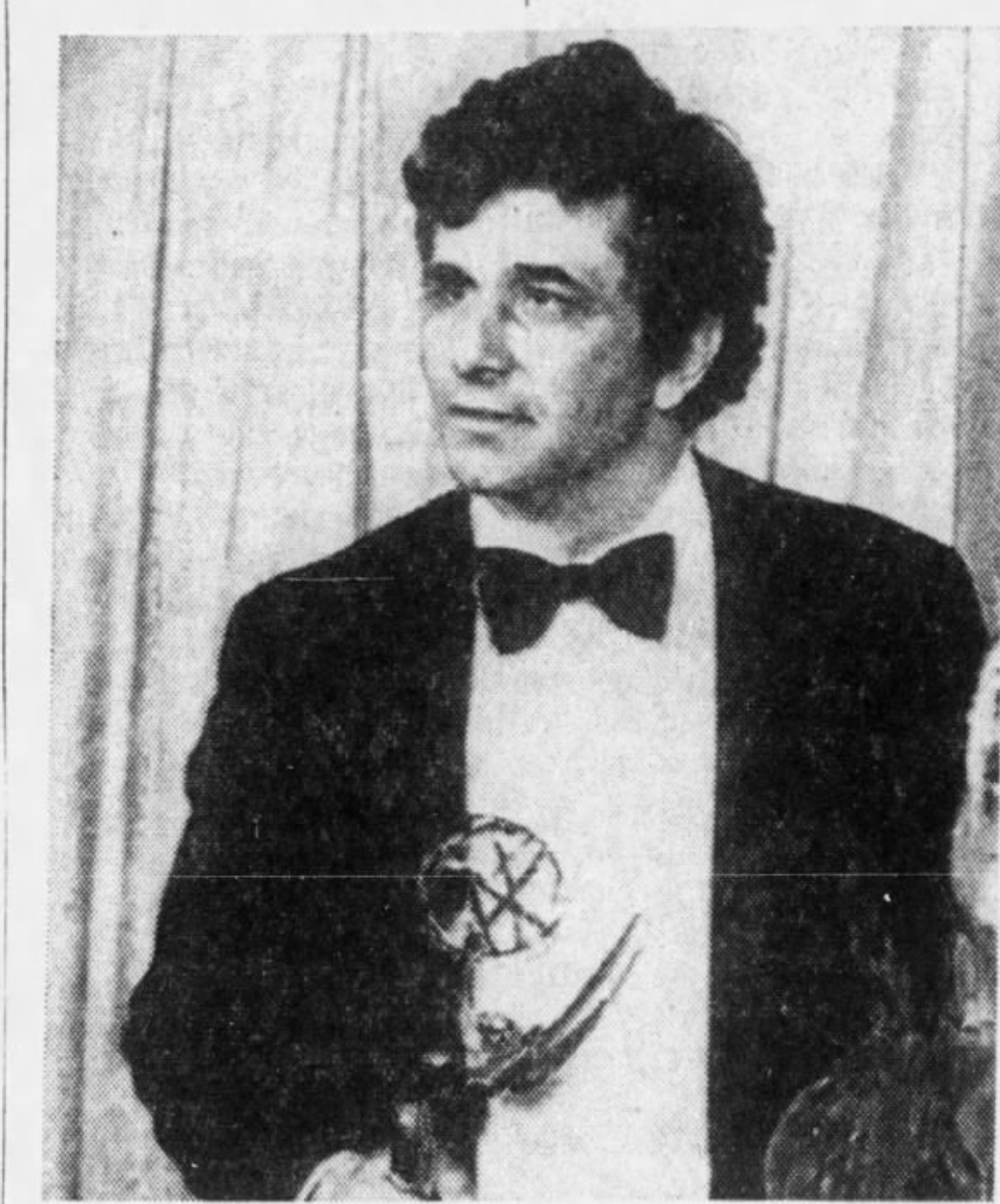
FALK WINS EMMY—Peter Falk won the award for the best performance by an actor in a leading role in a dramatic series at the Television Academy's 24th annual Emmy awards Sunday night.

Increased costs are cited by other opponents. Montana's legislature costs slightly more than $1 million for the biennium, but even if the cost were doubled because of annual sessions, the total would still be less than one per cent of the total state budget.